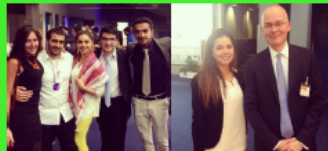
International Party with Nokia CEO

Selected out of a pool of 1400 applicants as the only Jordanian student to participate at one of the largest Students conferences in the World in Cologne-Germany. The annual conference brings together 300 excellent students along to 50 prominent leaders and renowned executives from around the world; Bill gates was a speaker in 2004. The 16th WBD themed "disruptive innovation" offered us an ideal platform for a cross-generational and cross-cultural dialogue. I had a very fruitful personal debate with Nokia Germany CEO about the future of telecommunication.