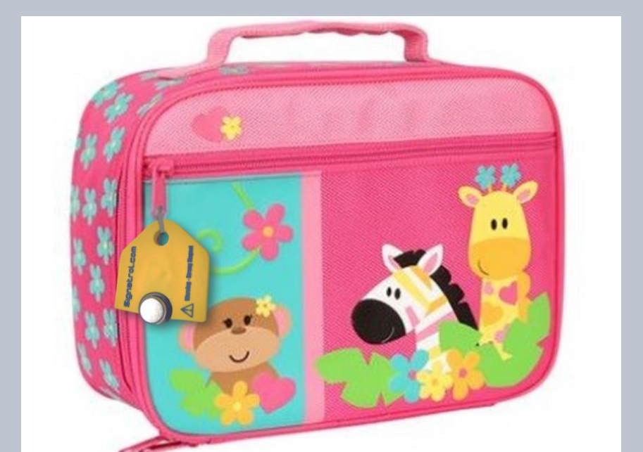
Figure 1. Example of a datalogger on a child's insulated lunchbox

The insulated lunchbox was packed with a sandwich, yoghurt, and a piece of fruit and an ice-pack each morning, 20 – 30 minutes before leaving for school. On arrival at the school the lunchbox was stored in the classroom until lunchtime (09.00 – 12.30).