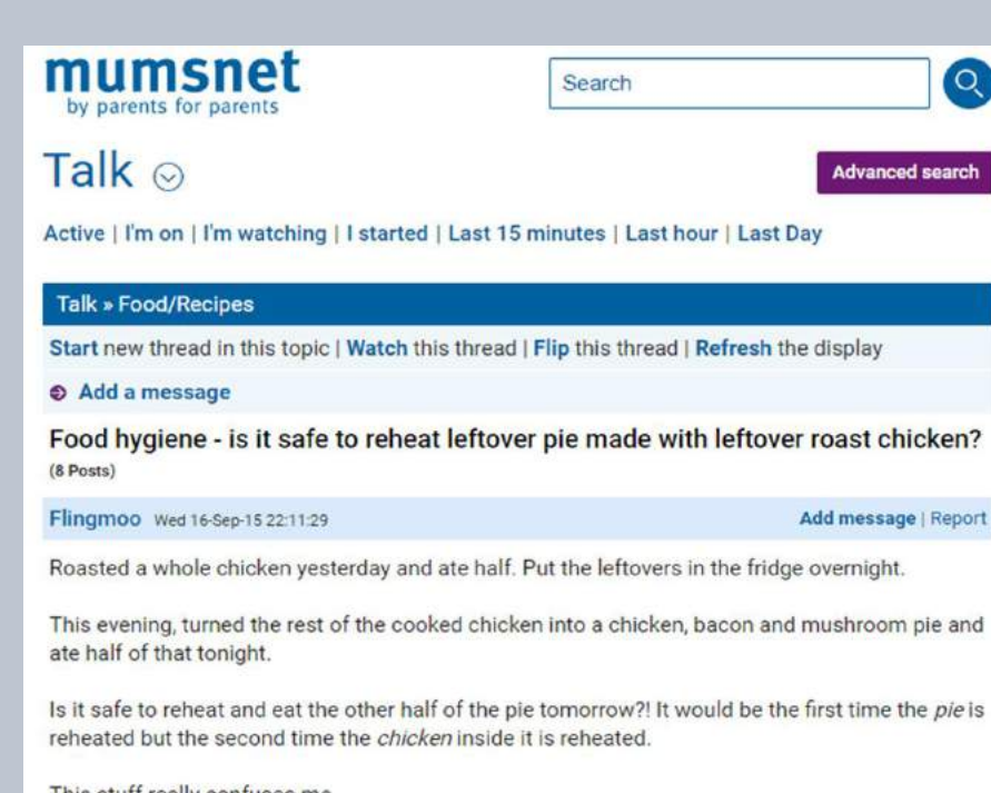
Figure 2. Forum question regarding safe of reheating left over cooked food.