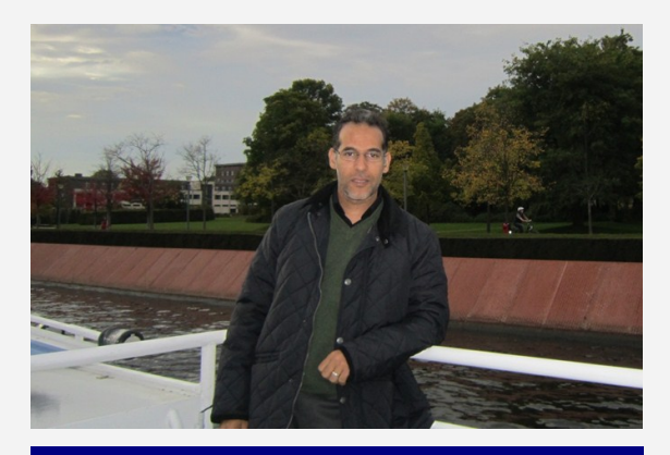
Boat trip around Berlin organised by Freie Universität Berlin

On 11-12 November, 2014, the University of Algiers in Algeria held a promotional road show event in which university vice-rectors and representatives from Algeria and Europe discussed the project with future applicants and shared their experience in the project.