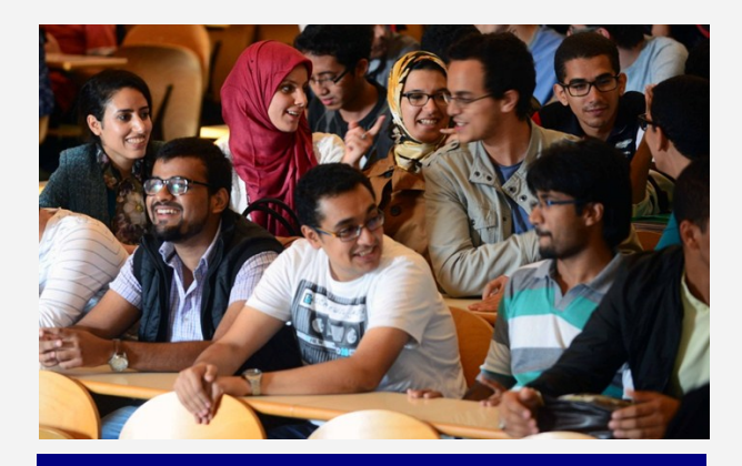
Welcome sessions at Ecole Centrale Nantes

During July –December 2014, across Europe, Morocco, Egypt, Tunisia, Algeria, and Libya, the First Cohort of EU-METALIC II began their mobilities. Students of all levels and across Europe and North Africa are participating. Host universities welcomed students with specially planned events.