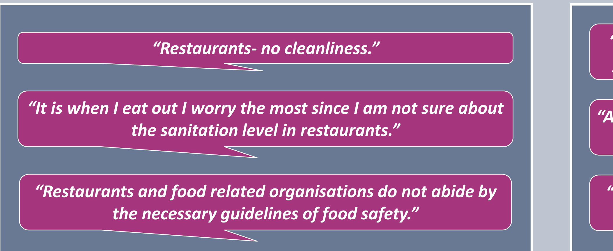
Figure 1. Consumer food safety concerns regarding restaurants.

Lebanon to be high. Restaurants in particular were cited by many as a very likely place to contract a foodborne illness, with some participants reporting to avoiding eating outside of the home altogether.