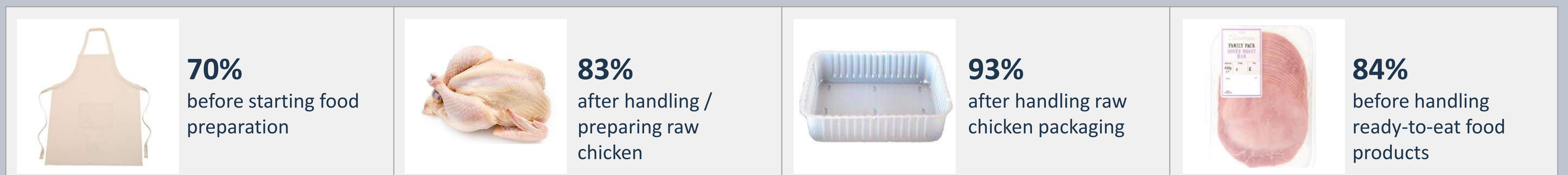
Figure 3. Occasions which older adults failed or inadequately implemented hand cleaning ( n=100 )