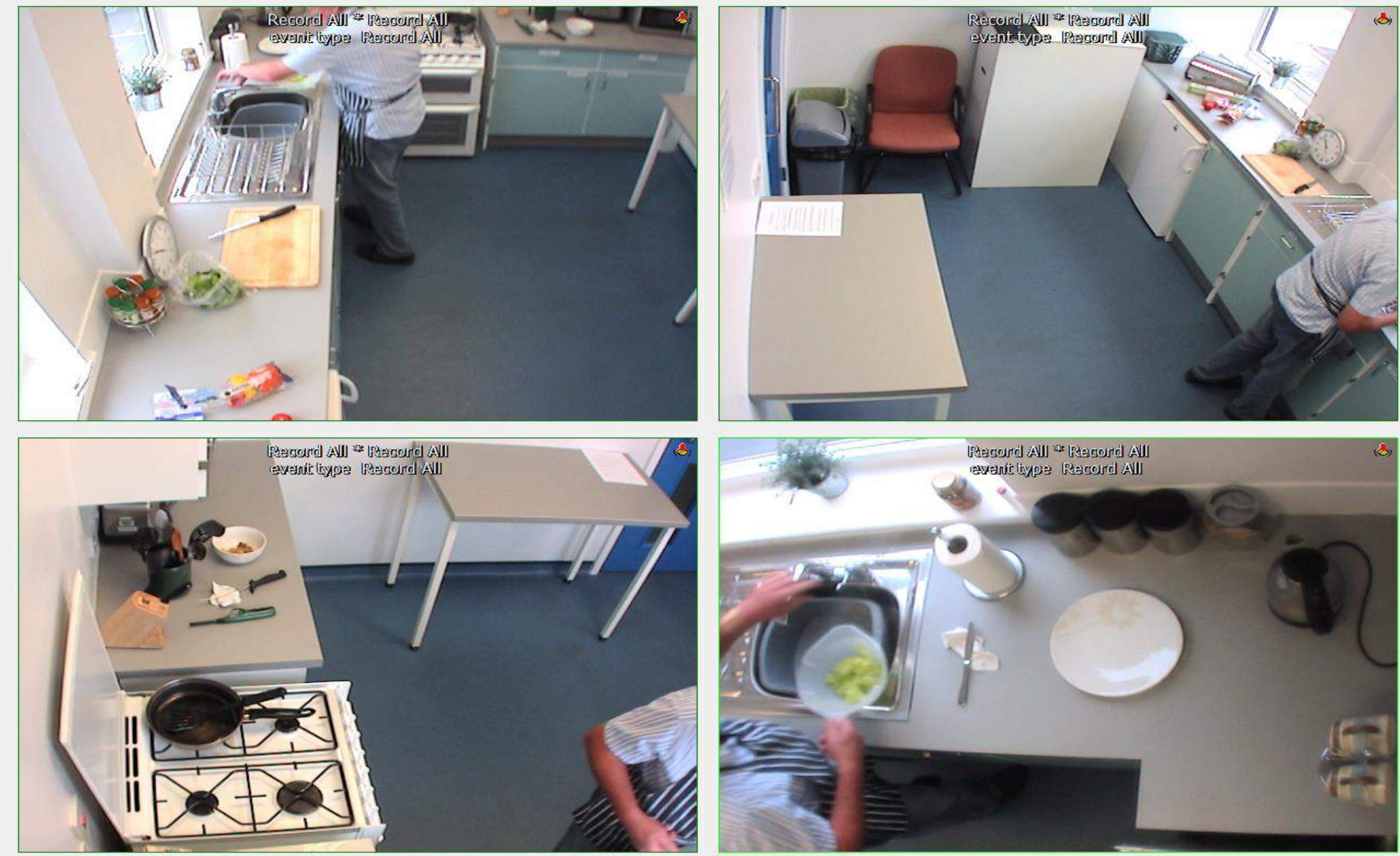
Figure 1: The fields of vision from the ceiling mounted digital cameras in the model domestic kitchen at the ZERO2FIVE Food Industry Centre.